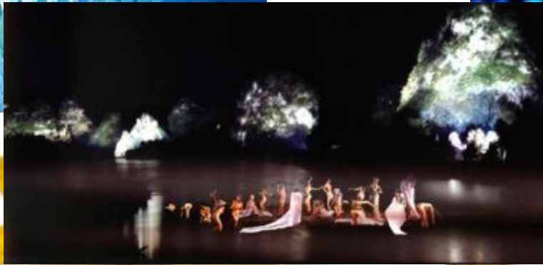
Impression Liu Sanjie