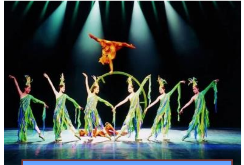
Dreamlike Li River Show