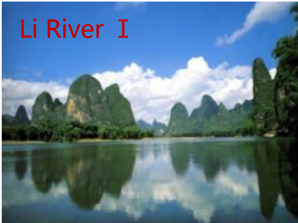
Li River I