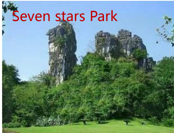
Seven stars Park