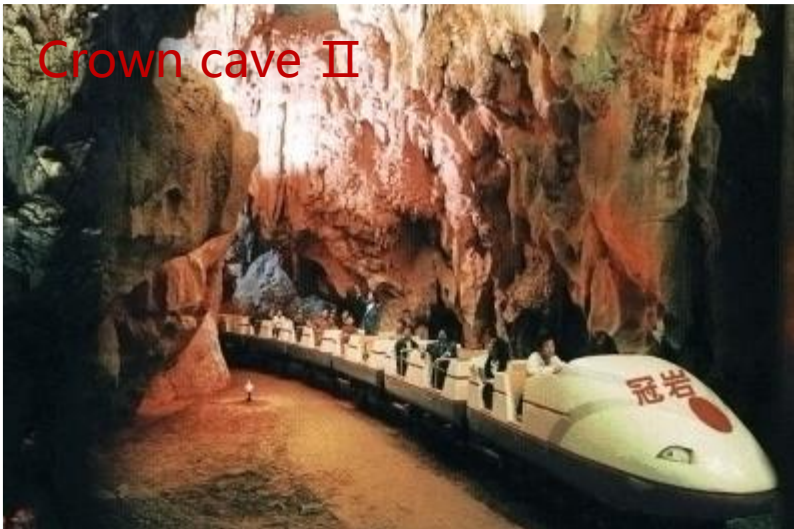
Crown cave II