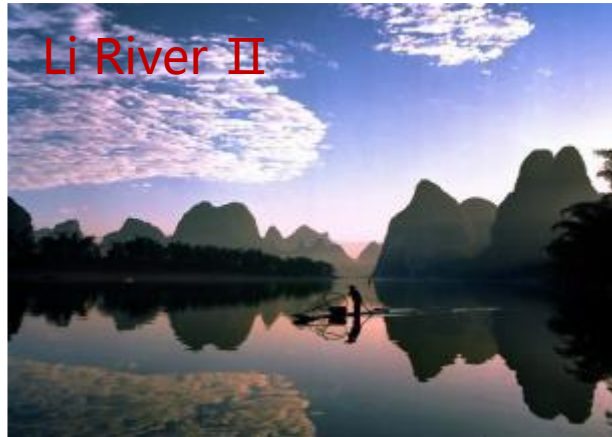
Li River II