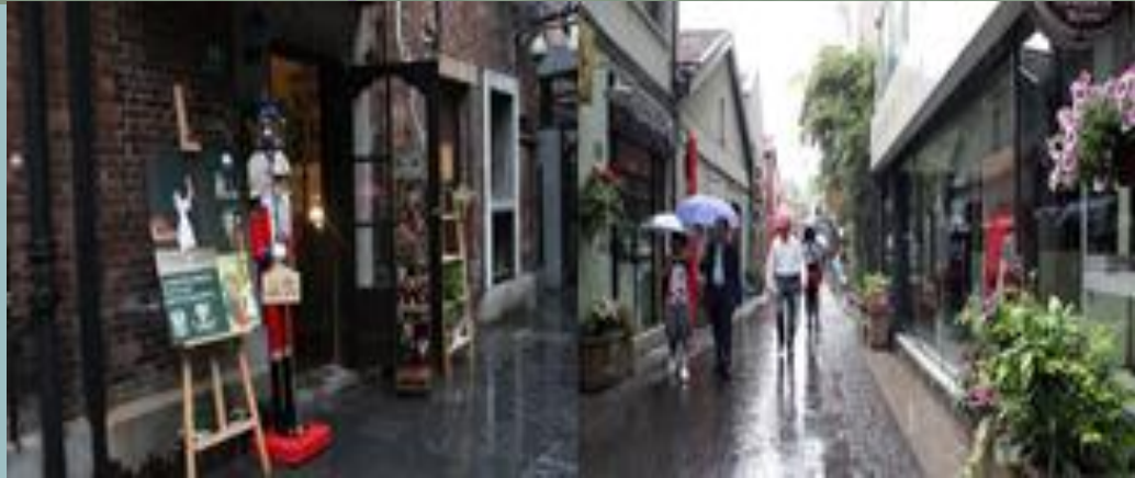
Tianzi Fang Art