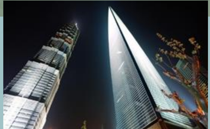
World Financial Center