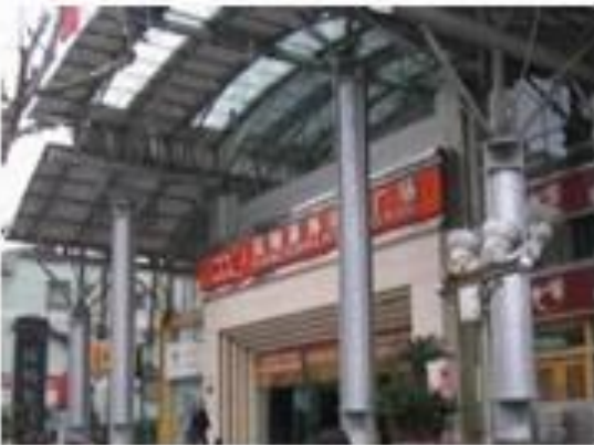
Tao Bao Cheng (Tao Bao City)