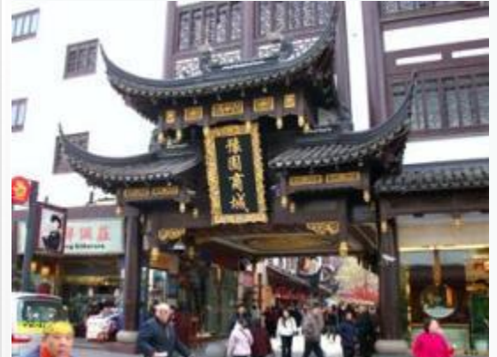
Yuyuan Tourist Mart