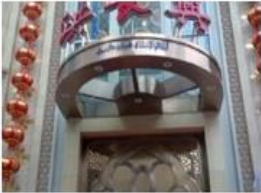
Hong Chang Xing Restaurant