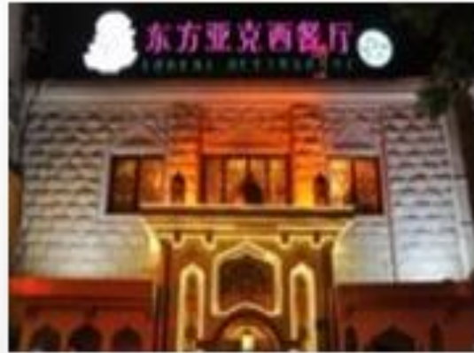
Ya Ke Xi Restaurant