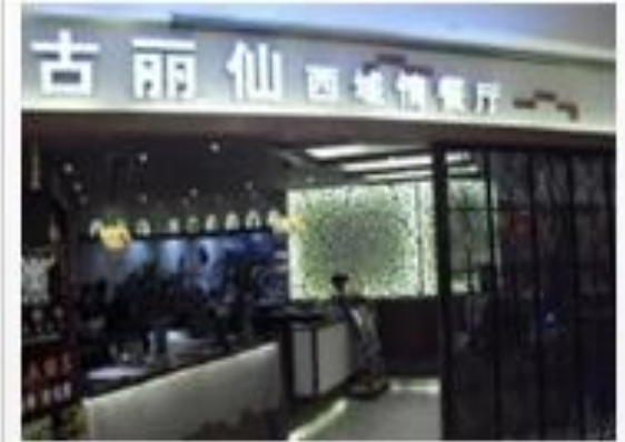
Gu Li Xian Restaurant