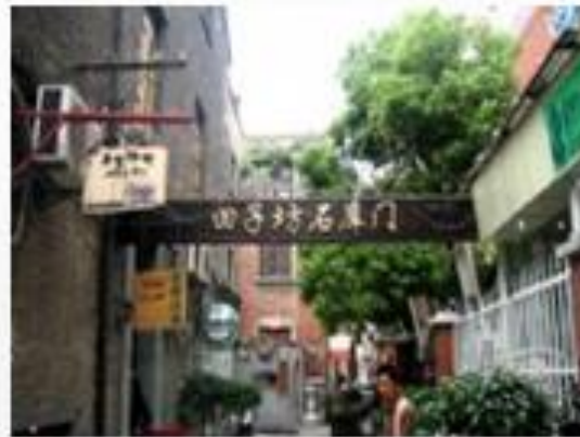
Tian Zi Fang