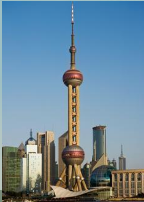
The Oriental Pearl Tower