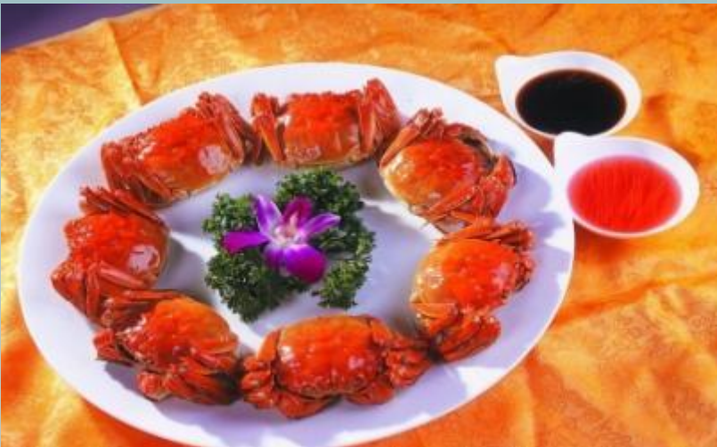
Chinese Mitten Crabs